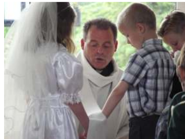
Key Stage 1 Wedding Celebrations

Our Religious Education curriculum is in accordance with the Cambridgeshire Agreed Syllabus for Religious Education. We aim to teach our children about beliefs and values that reflect the predominantly Christian traditions of this country. We feel it is important to also reflect in our school that ours is a modern multi-cultural society. We expect our staff and pupils to respect the beliefs and practices of others and encourage the development of sensitive attitudes towards each other's beliefs.