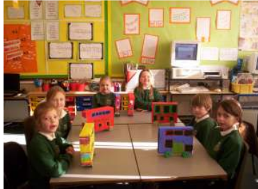
Art in Motion

What makes a good design? Why is one material better than another? Our Design Technology lessons are aimed at giving children a practical opportunity to investigate how and why familiar objects work. They work collaboratively to seek solutions to many everyday problems. Design work stimulates inventive thinking and creative problem-solving skills.