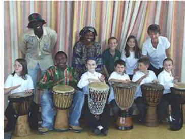
Upwood Beats to African Drums

Drama gives children a valuable opportunity to explore ideas creatively and imaginatively. In this way they may discover more about themselves and others and come to a deeper understanding of topics that are covered in different areas of the curriculum.