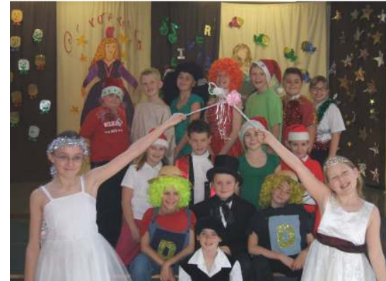
Our Annual Finale

Whilst every care has been taken to ensure accuracy at the time of publication some details may be subject to change as the school year progresses. We hope that you've found our Prospectus helpful and informative. We are always happy to help with any further information you may require and would be delighted to show you around our school. Please contact us through our School Office.