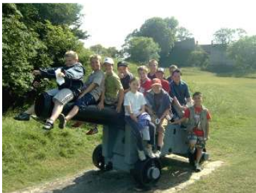
Isle of Wight Residential

Visits of various kinds are an important part of our school year. They fall into two main categories. Firstly, there are those that are directly linked with on-going work where the objective is to bring first hand experience to an area of study. These can be visits to specific places of interest, or can involve groups visiting the school, for example: African drummers and