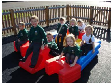
Phonics in Action

Each of these six learning areas contain a number of Early Learning Goals which set out what most children are expected to achieve by the end of the Foundation Stage. There are no formal tests during this Stage. Assessments are made and recorded via adult observations. These records contribute to the Foundation Stage Profile which is a summary of each child's attainments compiled at the end of the Foundation Stage and measured using the Early Learning Goals.