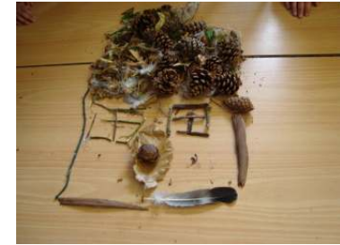
House of Cones

We believe children's imagination is enriched through artistic expression. At Upwood Primary School our Art and Design curriculum encourages children to develop ideas and express themselves creatively. They learn the skills and processes of modelling, printing, observational drawing, sketching, painting and collage, through handling and exploring a simple range of materials such as paint, clay, pastels, paper and fabric. Children learn how to review their own work and that of others, developing critical, observational and communication skills.