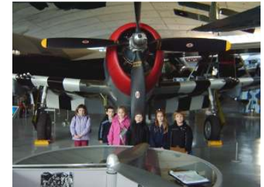
Duxford Air Museum

The 1988 Education Act states that charges may not be levied for activities organised by the school such as day trips and residential visits. The Act specifically states that any activity that takes place in school time, or mainly in school time, must be free - except for the cost of board and lodging. There is no restriction on requesting voluntary contributions.