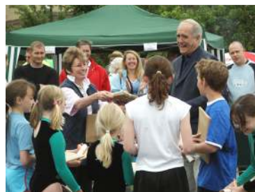
At the Village Fete

We believe education is a route to equal opportunity for all. Our staff are aware of the need for the curriculum to reflect cultural diversity. We ensure that the classroom is an inclusive environment in which all children feel all contributions are valued.